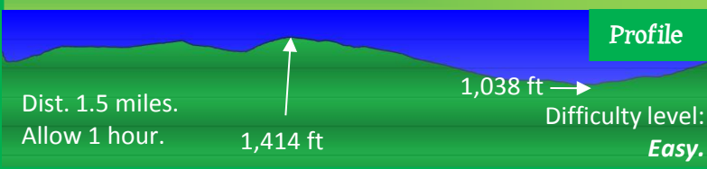
Base cartográfica © Instituto Geográfico Nacional de España