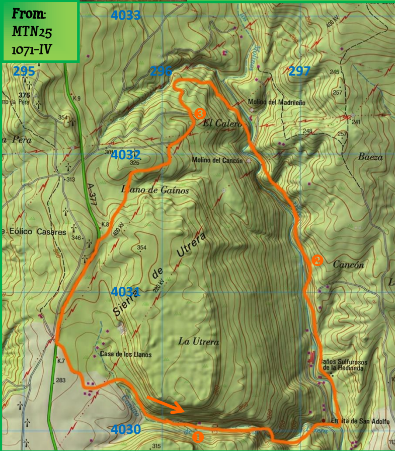
Base cartográfica © Instituto Geográfico Nacional de España